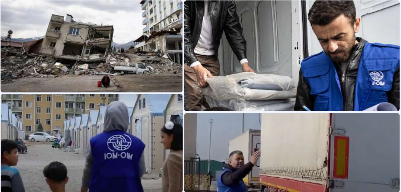
IOM provides emergency support to survivors of the earthquakes in Türkiye and Syria.

Two devastating earthquakes struck the southern area of Türkiye and northwest Syria on February 6, 2023. The first earthquake, of 7.7 magnitude, was one of the strongest to hit the area in more than 100 years. The earthquakes took tens of thousands of lives and affected millions of people; hundreds of thousands were left homeless.