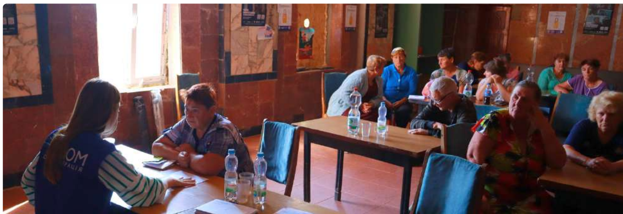
Male beneficiary from Sumska oblast

“ After there was an explosion in our neighbor’s yard, all our windows were blown out due to the shock wave. With the vouchers we received we were able to order new prefabricated windows from the store. These windows were then delivered and installed in our houses which made it accessible, especially for us pensioners. ”