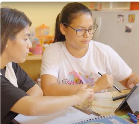
Entrepreneurship in Movement training participant

Through Entrepreneurship in Movement, Citi Foundation’s collaboration with USA for IOM is rebuilding livelihoods and fostering dignity for thousands of people, giving Venezuelan migrants and refugees the agency to drive positive socioeconomic change in their host communities. USA for IOM is grateful to the Citi Foundation for its cornerstone investment in the Entrepreneurship in Movement program.