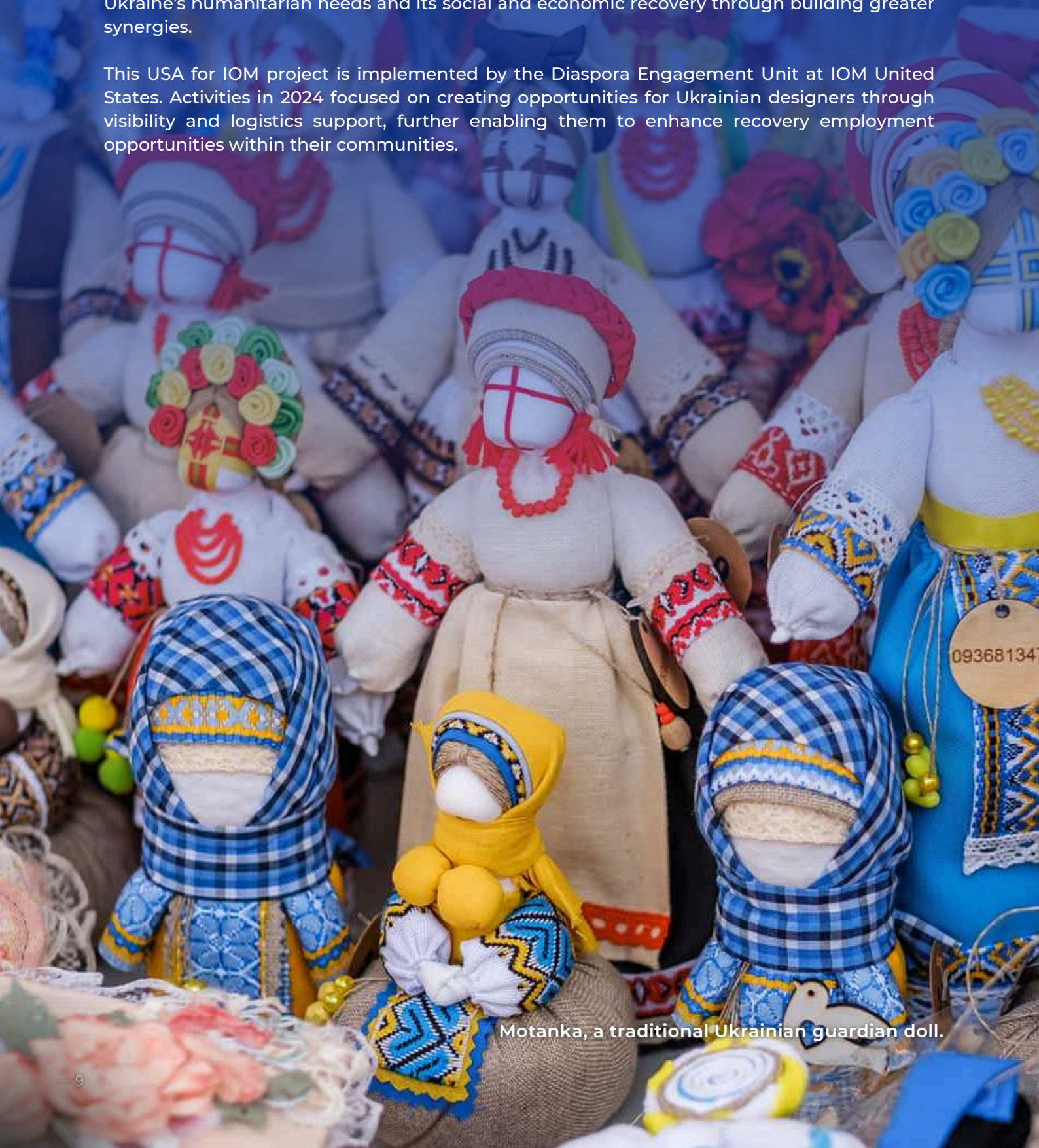
Motanka, a traditional Ukrainian guardian doll.

This USA for IOM project is implemented by the Diaspora Engagement Unit at IOM United States. Activities in 2024 focused on creating opportunities for Ukrainian designers through visibility and logistics support, further enabling them to enhance recovery employment opportunities within their communities.