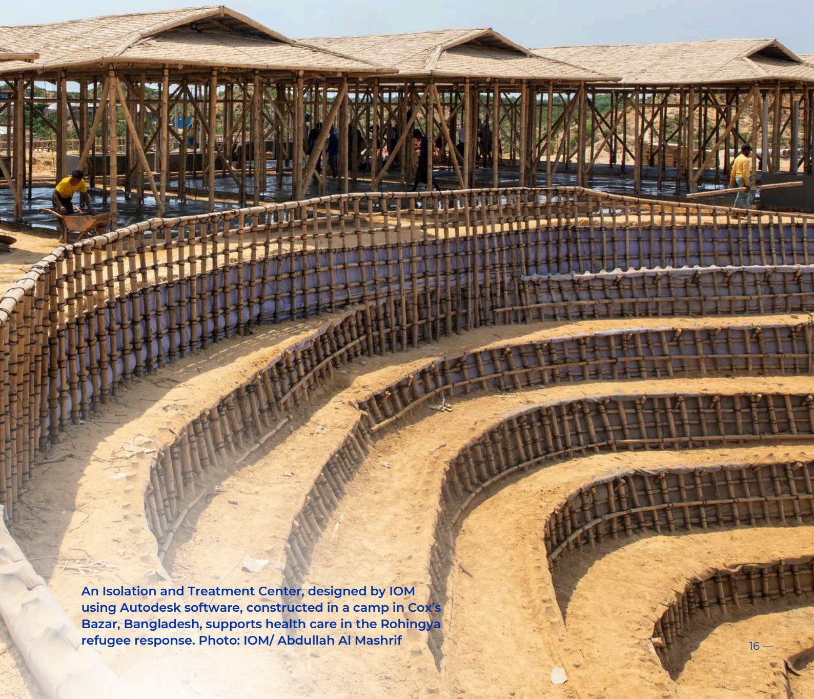
An Isolation and Treatment Center, designed by IOM using Autodesk software, constructed in a camp in Cox's Bazar, Bangladesh, supports health care in the Rohingya refugee response.

This is the largest donation since the IOM – Autodesk partnership began in 2018. The licenses, from the Autodesk Architecture Engineering & Construction Collection support staff to design safe and sustainable shelters, improve mapping and design quality, and facilitate communication between project stakeholders.